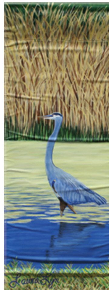
Great Blue Heron By Laura Walker

Don't Forget SDAG Membership forms are due with payment September 1 . Current membership is required to show at the gallery.