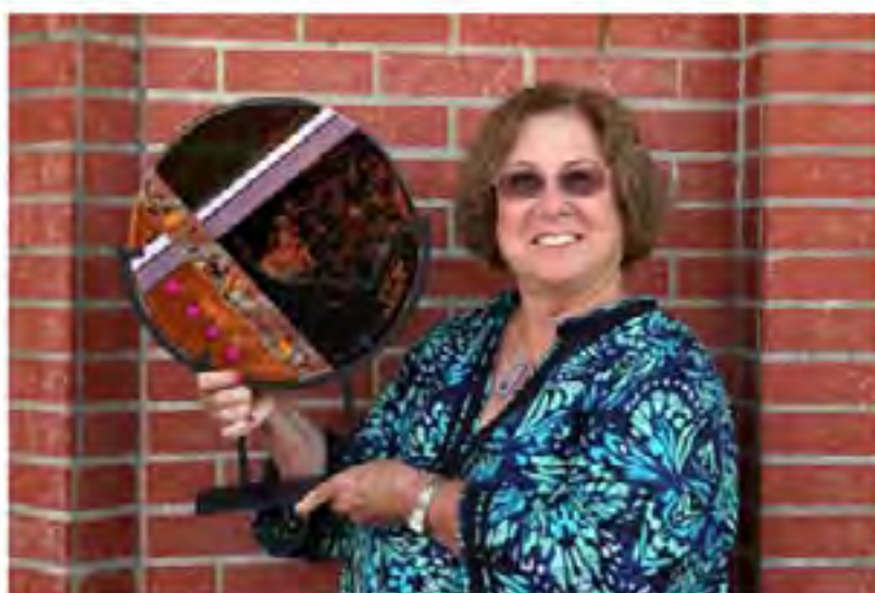
Spring Comes Late by Bobbie Hirschhoff