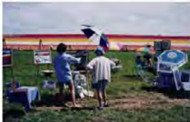
Painting at the Carlsbad Flower Fields