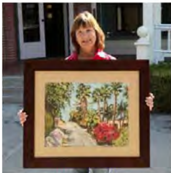
BEST OF SHOW Old Encinitas by Diane Dudek