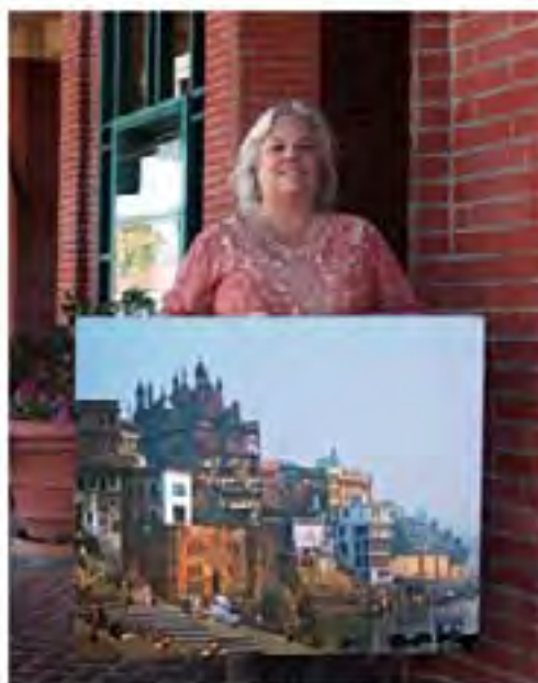
Varanasi