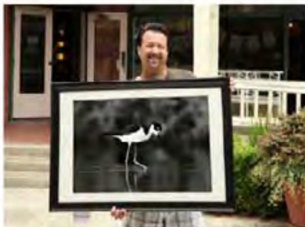
Black Necked Stilt Waterdrops, John Tsumas