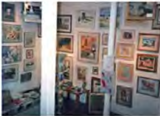
Downstairs at the Off Track Gallery

They hosted a 30th birthday party, held paint-outs at the Carlsbad Flower Fields, went on a day-trip to Calafia in Baja, Mexico to paint and draw.