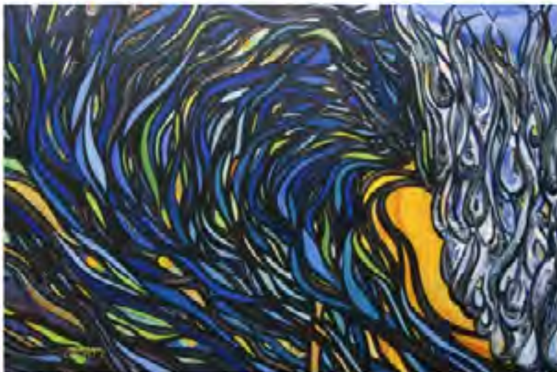
Tamara Kapan, Sludge (measures 72 x 48 and was painted with acrylics on canvas)