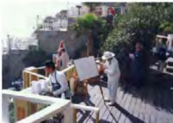
A day trip to Calafia, Mexico