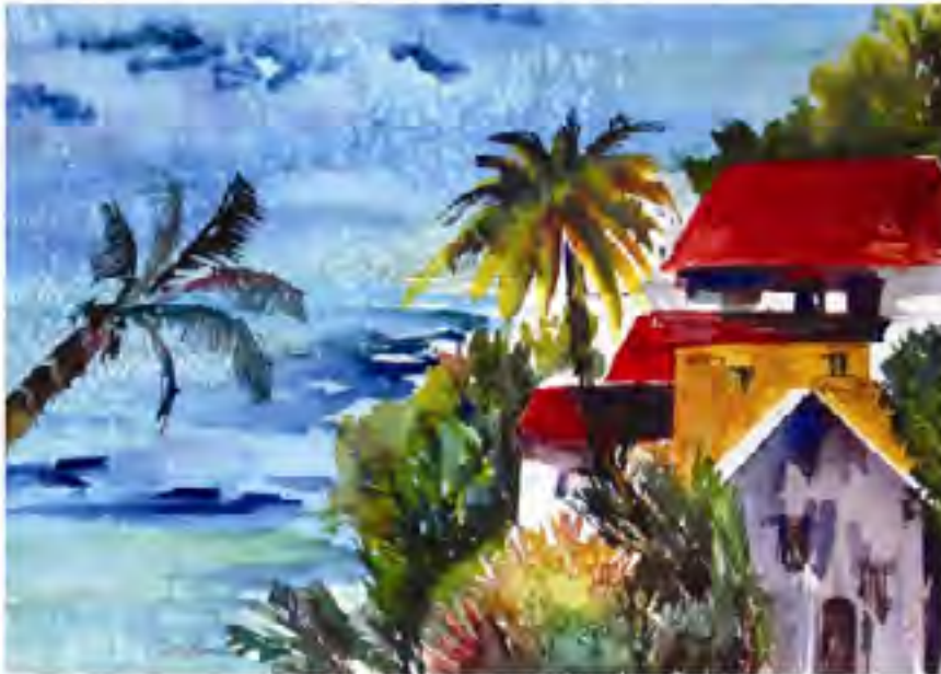
Dotty Reiman, The Villa