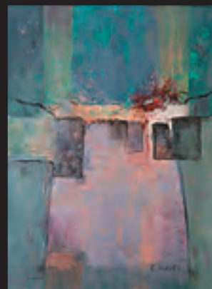
ELLIE HAVEL WAGONER