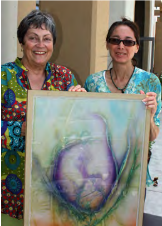
Hanging the Oncology Show August 8, 2009