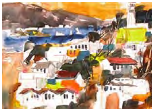
Coit Tower, San Francisco