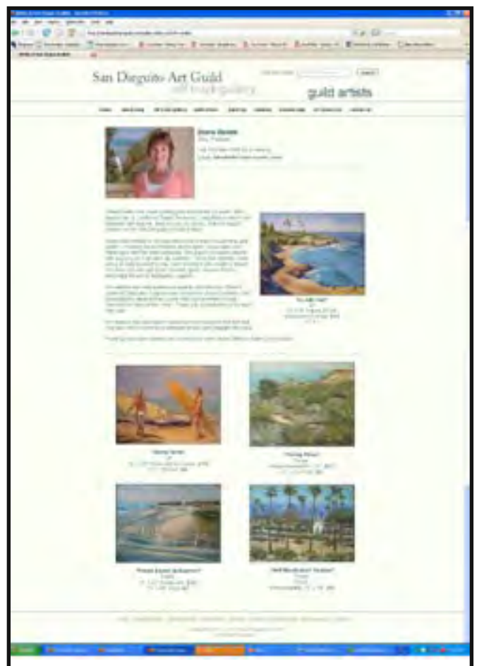
This is a sample of the Individual Page that is available for SDAG members for a set up fee of $25.