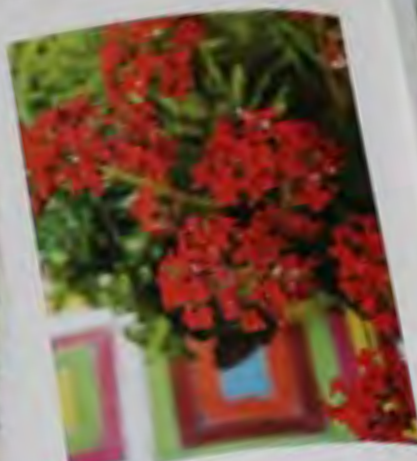
Bright red Bonn