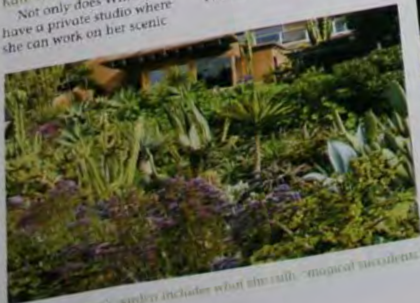
Charlene Burrey's garden includes what she calls "magical succulents"