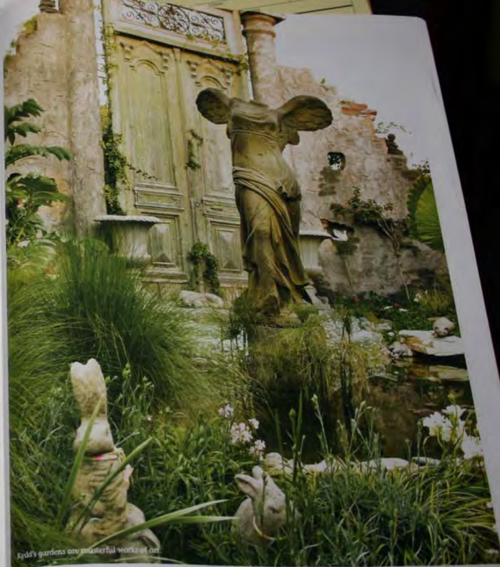
Kydd's gardens are masterful works of art.