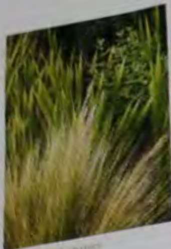
Photograph of garden