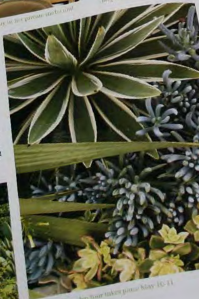
The annual garden tour takes place May 10-11