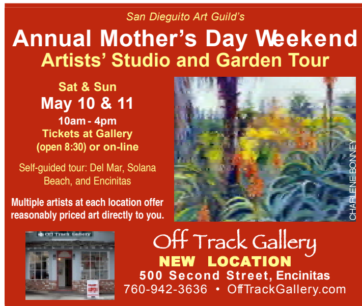
Art and Gallery Guild ad for Spring of 2008