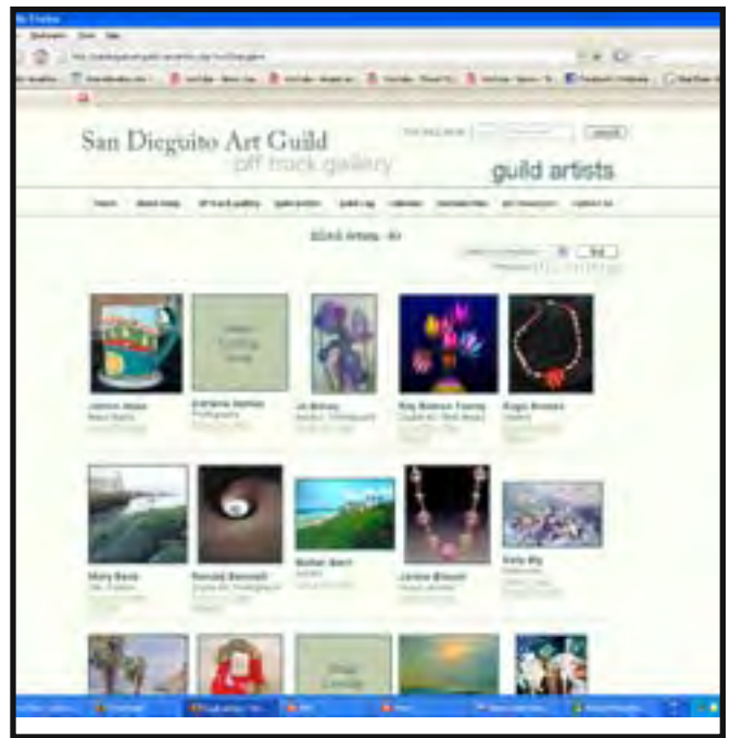
These are samples of the thumbnails that are free for every SDAG member.

BAE sales by Dot Renshaw: “Garden Beach” $100 , “Tuscan Garden” $200