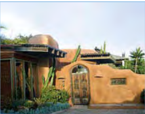
Home of Charlene Bonney in Encinitas, CA, near Moonlight Beach.

A portion of the proceeds from the tour will be donated to a local charity. Off Track Gallery, 760-942-3636, located at 500 "D" Street, in downtown Encinitas.