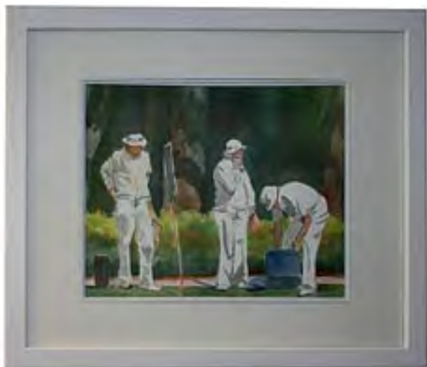
“Setting Up” by Lydia Velarde