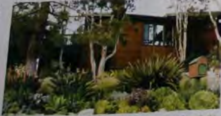
Wendy Gauntlett-Shaw's home is called "The Bird Nest" and overlooks Indian Head Canyon