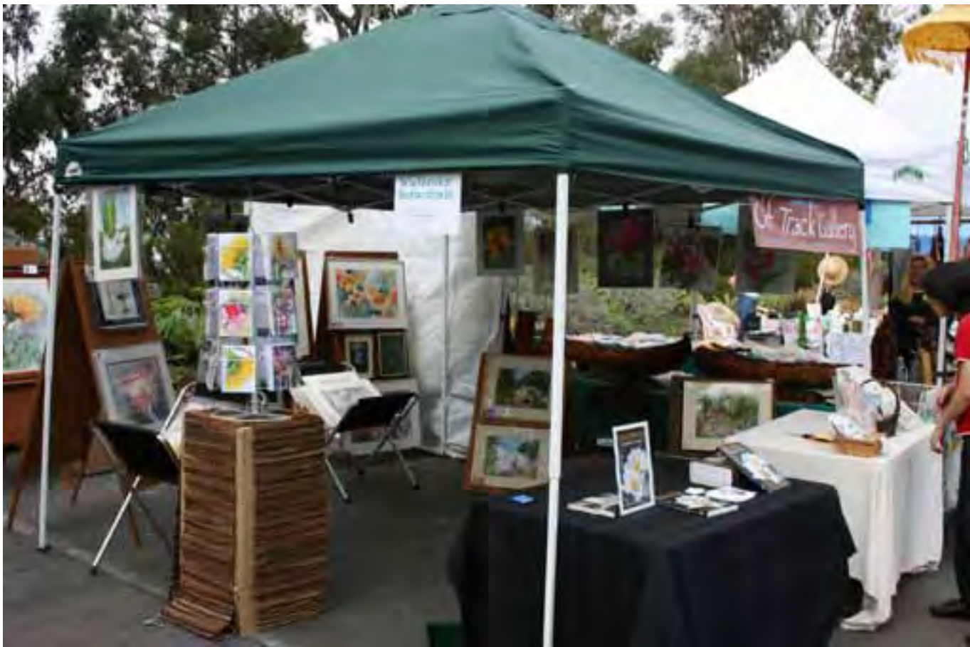
SDAG booth at QBG plant sale