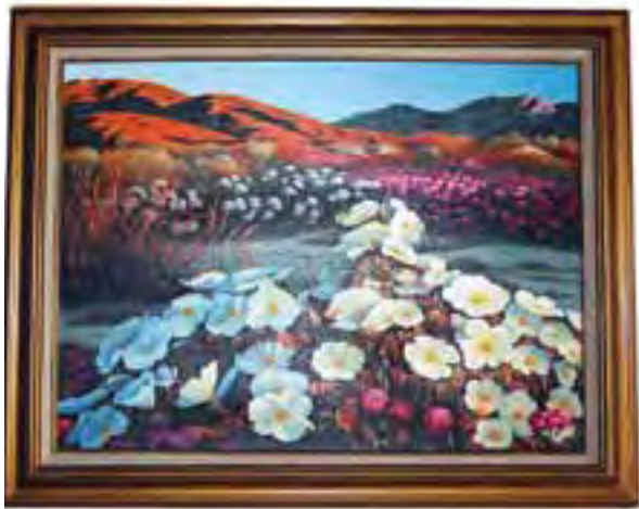
Best of Foyer, Art Lachte, Desert Sunrise