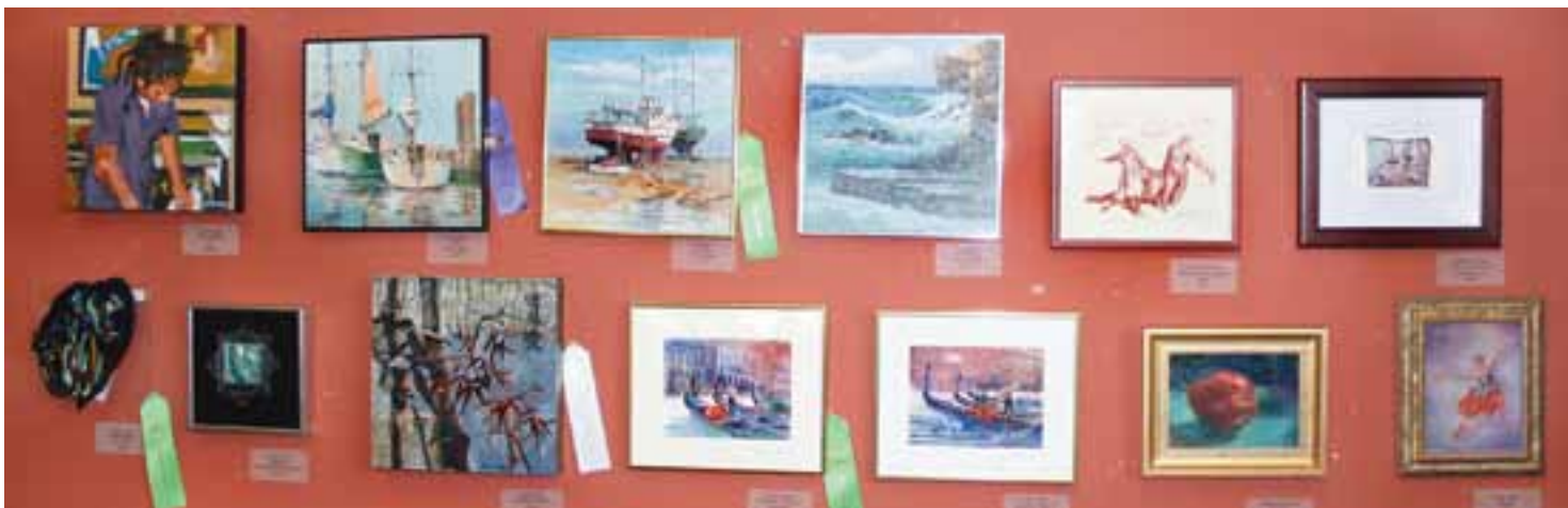
Part of the Small Image Show