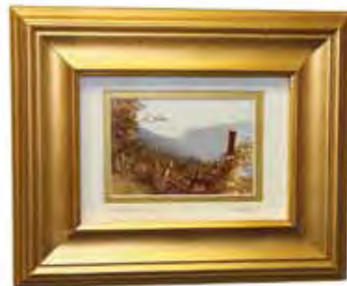
First place, Photography, Rudelle Fay Hall, "Almost Heaven"