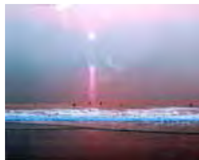
Mystical Surfing by Isabella Breasted