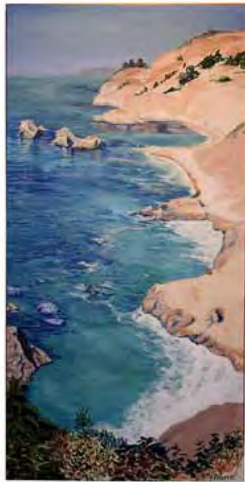
Painting by Faith Fleury

WATERCOLOR • OILS • JEWELRY • GLASS • SCULPTURE • PHOTOGRAPHY