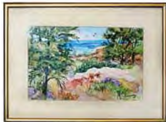
First place, Water Media, Janet Finney, "Canyon View" "