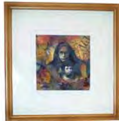
First place, Mixed Media, Harriet Shoup "Where To --- ?"