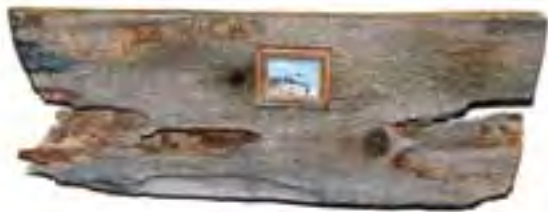
The smallest image in the show: Jackie Tyree's "Small Image"