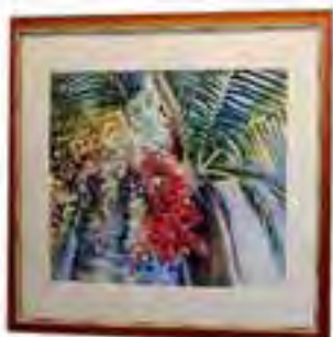
"Twin Palms" by Yanina Cambareri