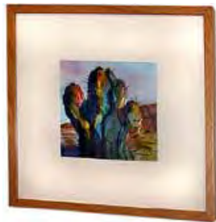
"Cactus at Twilight" by Laura Lowenstein