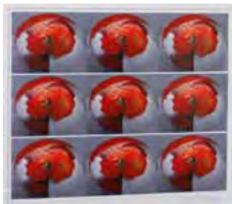
"IX Revolutions" by Agnes Lochte