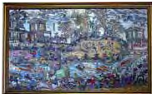
"Coastal Commotion" by Artie Mattson [SOLD]