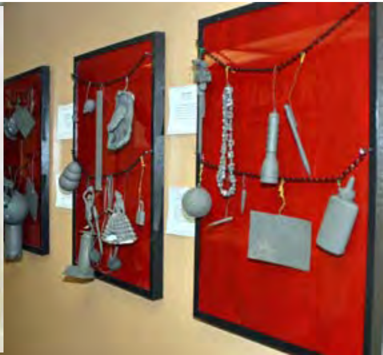
Piece from the Lux Art Institute Children's Show