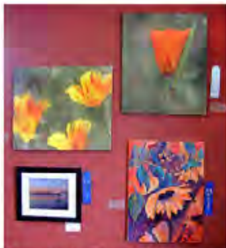
September show.