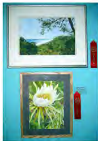
September show.

The newly formed Gallery Committee will be meeting monthly to assess what needs to be done to make our Gallery more visually pleasing, more functional and to keep things running smoothly.