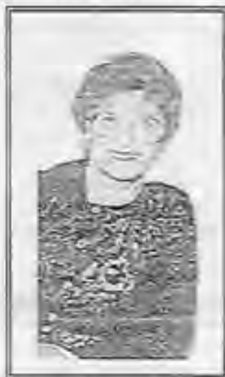
Director, Oceanside Museum Art School

Web Page. If someone told you that your web page would cost around $300.00 or so to build and that you would have