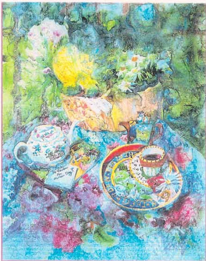
Winning Poster by Cyndy Brenneman. Available for sale as a poster.

OffTrack Gallery & Quail Botanical Gardens