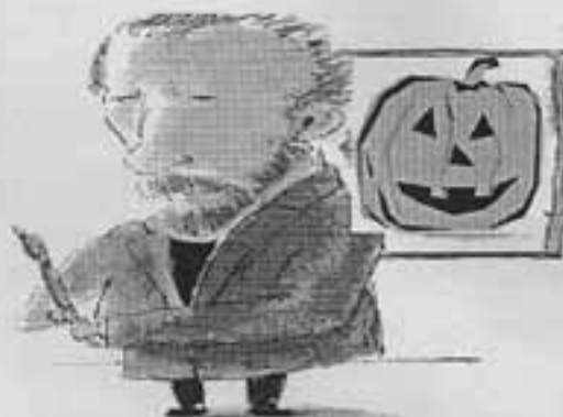
VINCENT VAN GOGH

The environmental Painters will meet at San Elijo Lagoon (n. end of Rios in Solana Beach) on Sept 8; Moonlight Beach (large parking lot at s. end of beach, up on the hill) on Sept 15 & 22; Torrey Pines Reserve (meet at lodge parking lot) on Sept 29 (Joan will have passes); Quail Gardens on Oct 6; Swami's on Oct 13 & 20 (meet at parking lot just south of the Self Realization Fellowship). These gatherings start at 9:00 a.m. and all artists are invited.