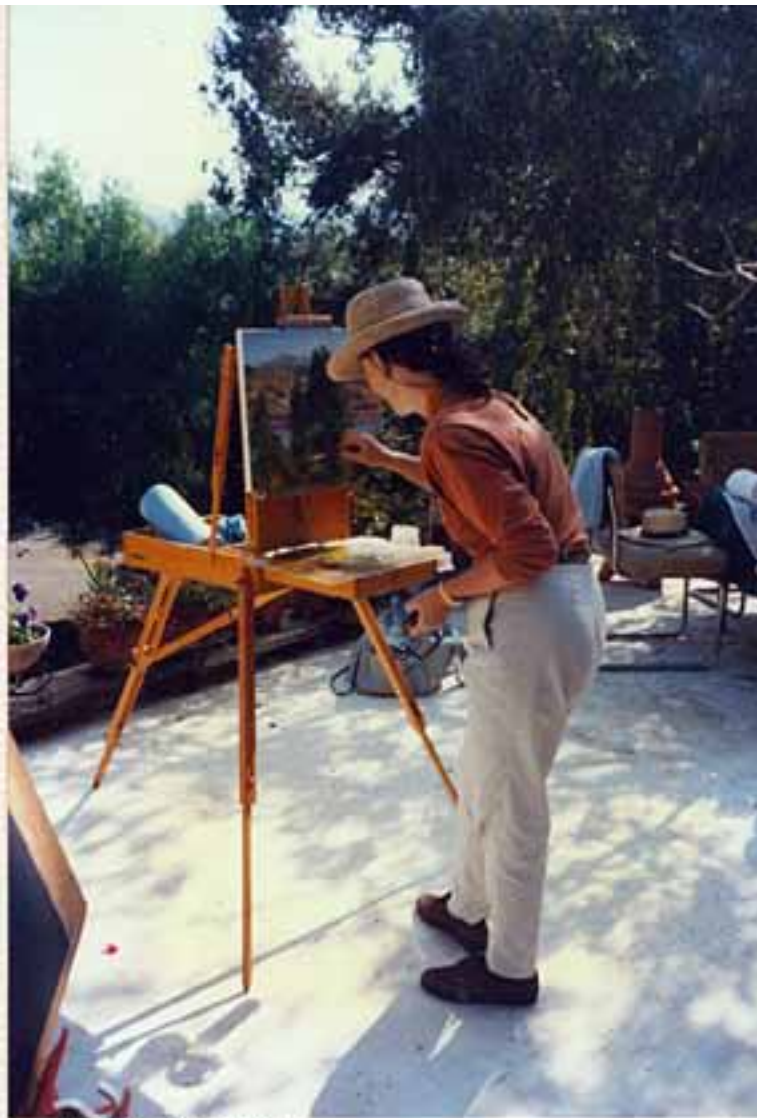
Where's the lake?