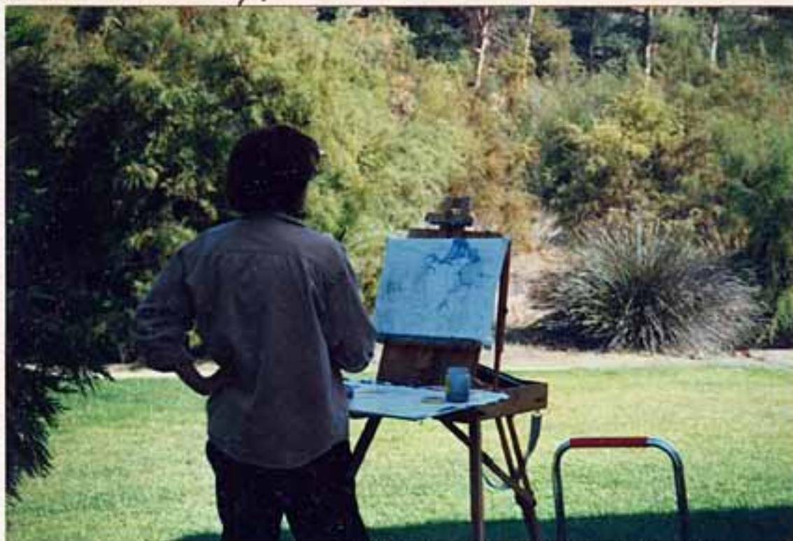
So much beauty and so little time to capture it all!!