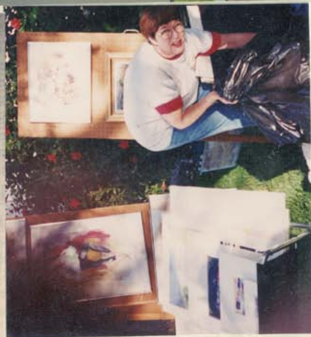
Coffee and Art at the Offtrack Gallery