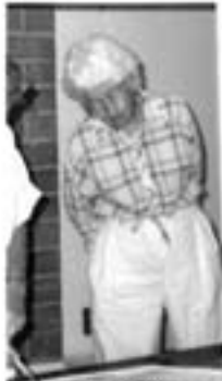
Bonney Park our S.D.A.G. A nail.