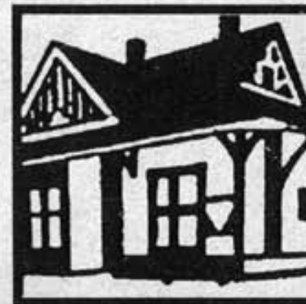
Old Santa Fe Railroad Train Station