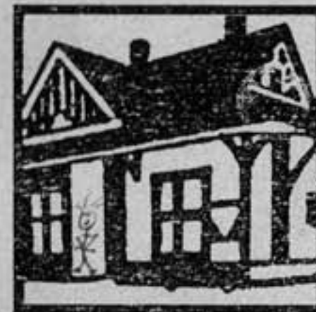
Old Santa Fe Railroad Train Station