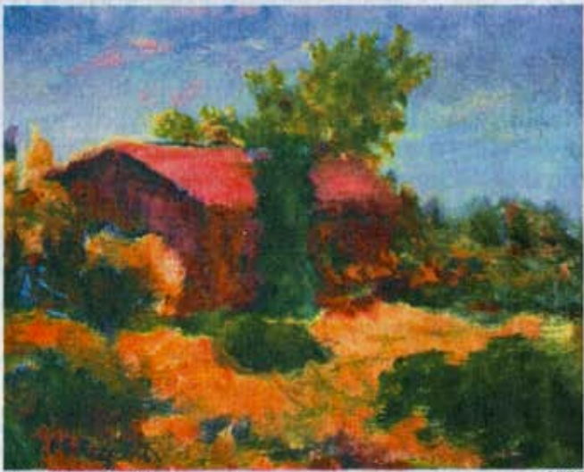
ENCINITAS BARN OIL ON CANVAS

Showing at Valerie E. Wong Gallery Studio # (619) 732 - 1341 101 Havenview Ln • Oceanside AND BY APPOINTMENT