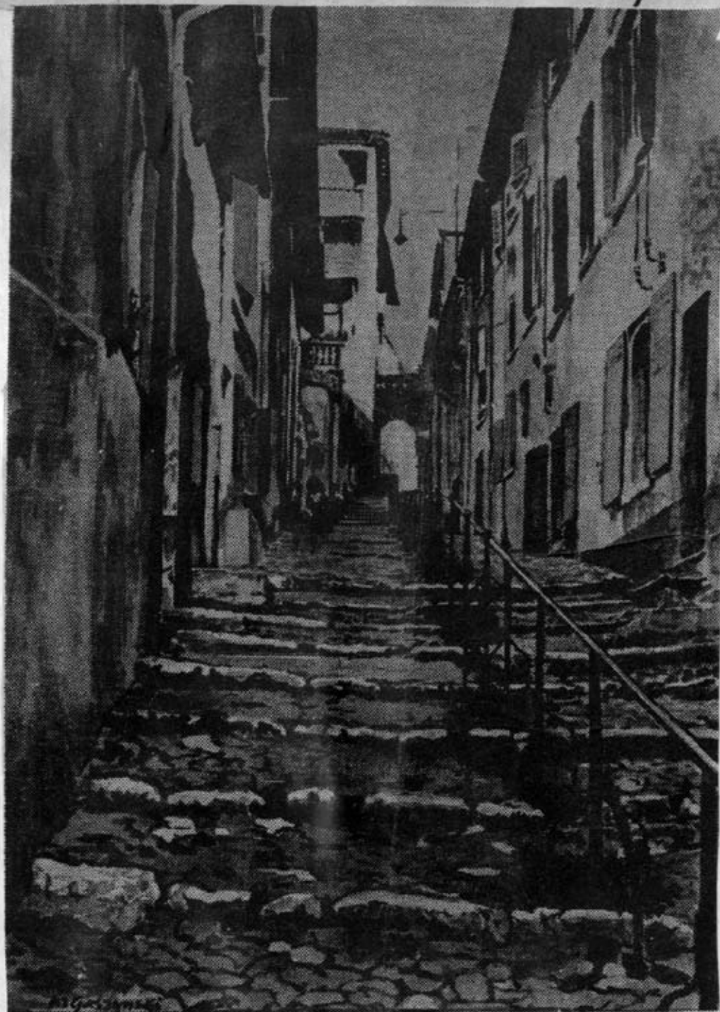
"EN PROVENCE" OIL