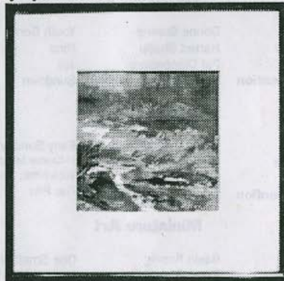
Vada Kimble First Place Watercolor

'Dear Sweet Vada' Why were you always hiding when the photographer came out??