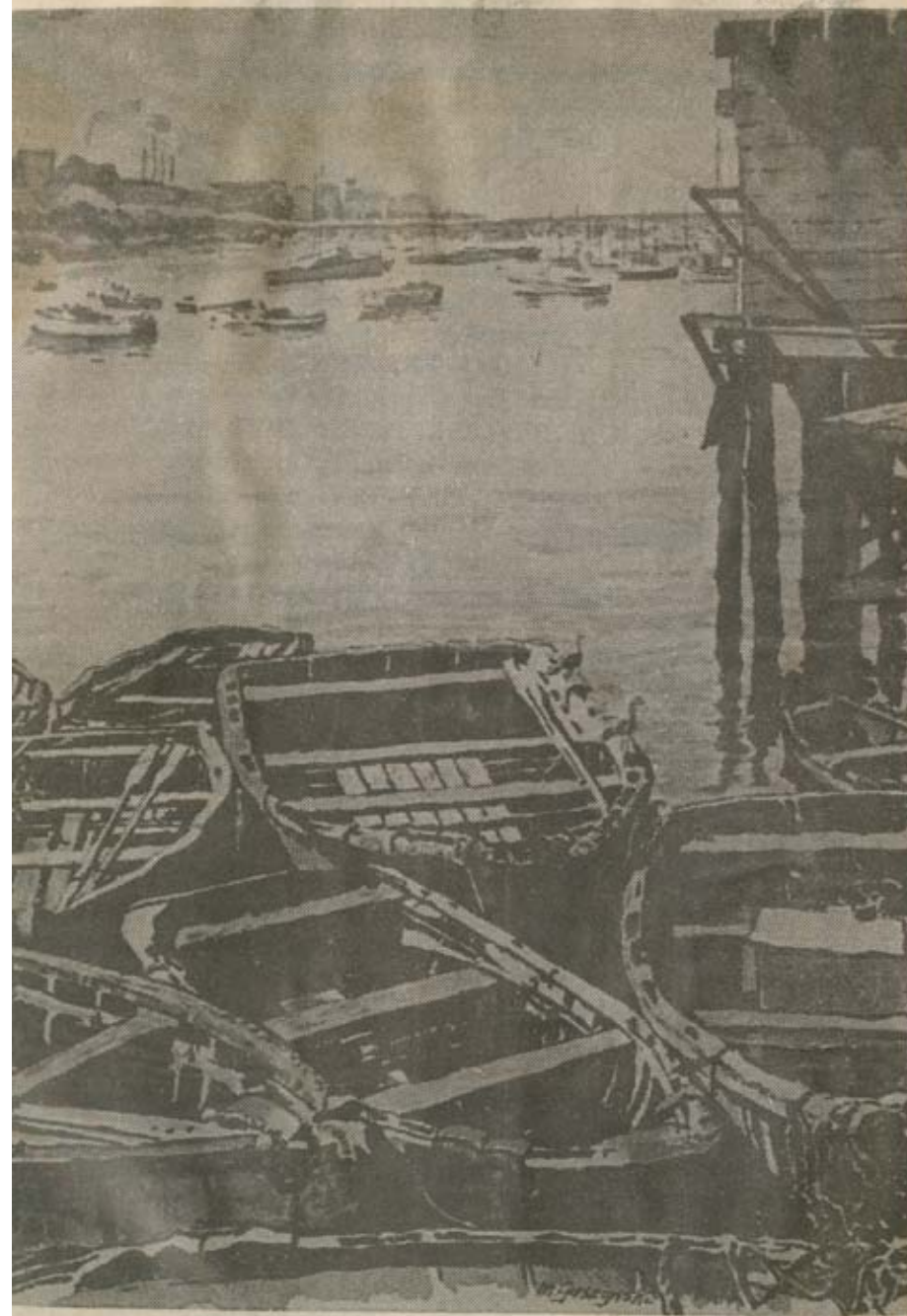
"BOATS AT MONTEREY"