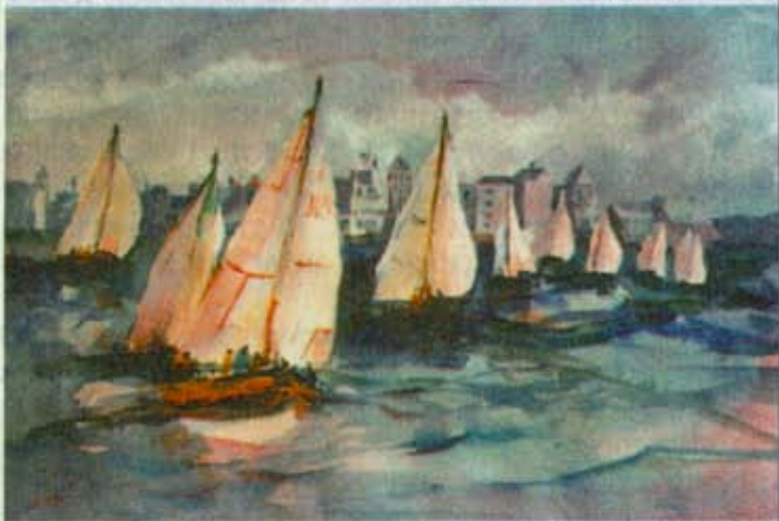
“SAN DIEGO” WATERCOLOR