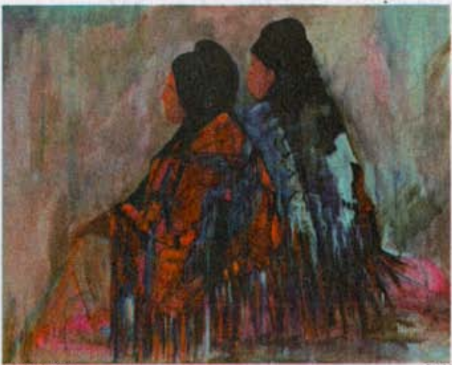
CAROUSEL ACRYLIC ON CANVAS

Gallery open 7 days a week from 9:00am to 5:00pm