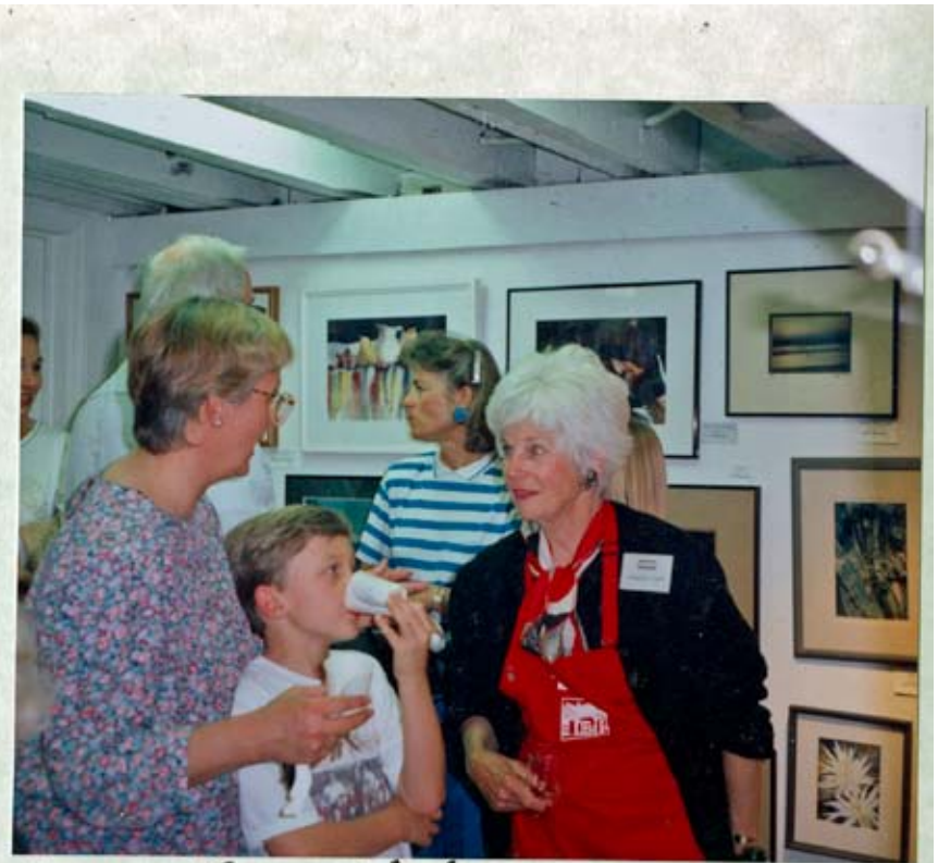
Paint Rag Editor - '96-'97' and hopefully future - S.D.A.G. has been blessed with these talented artists with business acumen.

"If an artist is honest to the influences which have shaped his work and honest in his interpretation of nature and his design concepts, personal style will emerge."