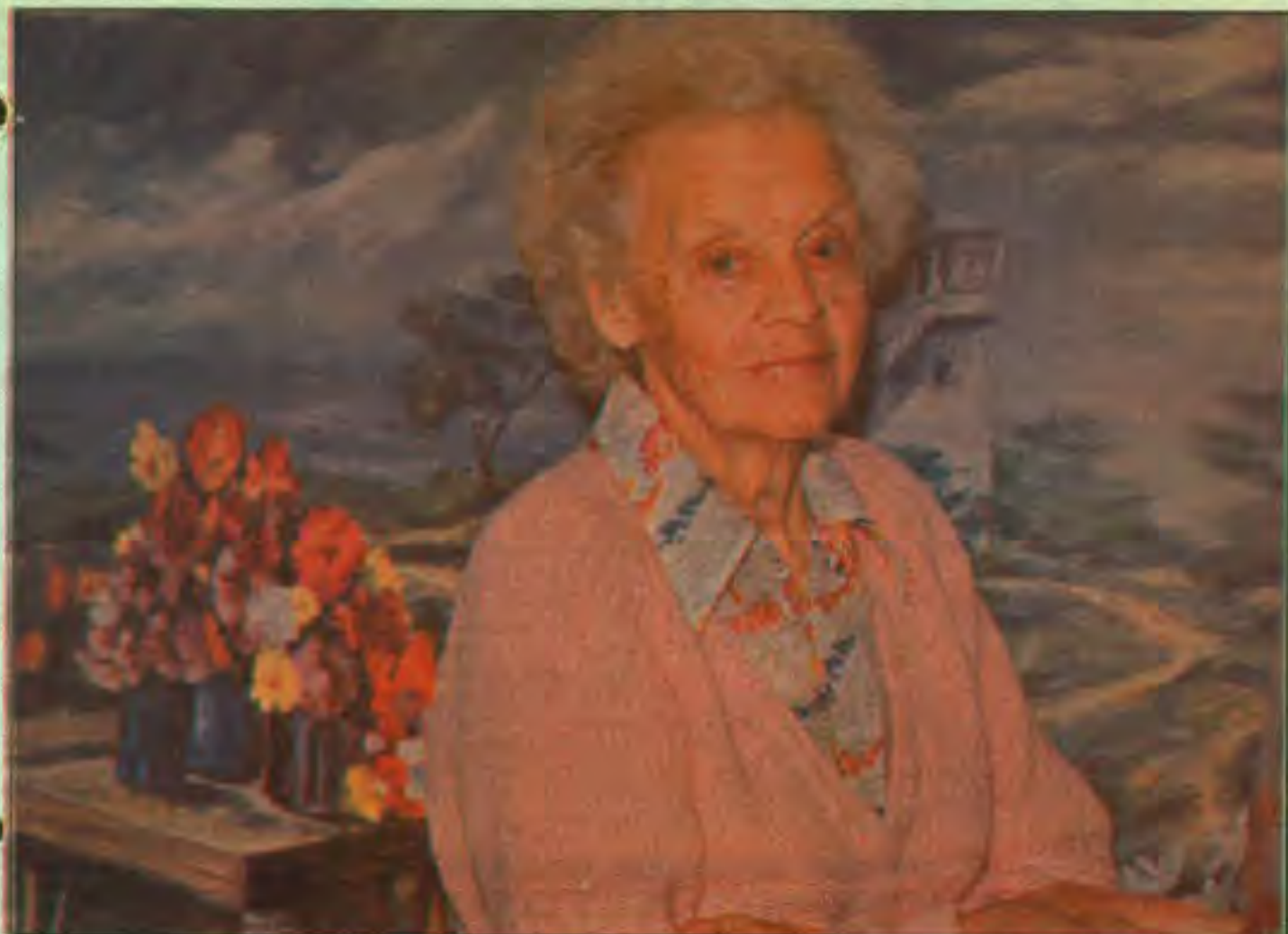
Greta Grossman has a long history of award-winning designs.