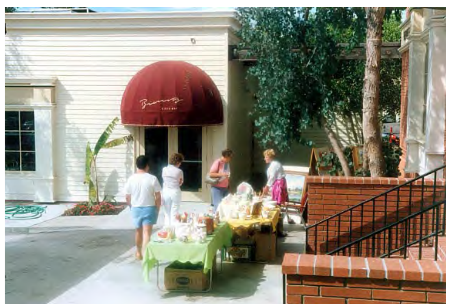
Art Mart at "Old Market Patio"