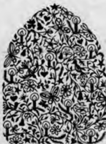
Britta Kling's work; Offtrack Gallery

featured for sale this month in a new series called Seven Swans a-Swimming . A traditional technique of nearly ex-