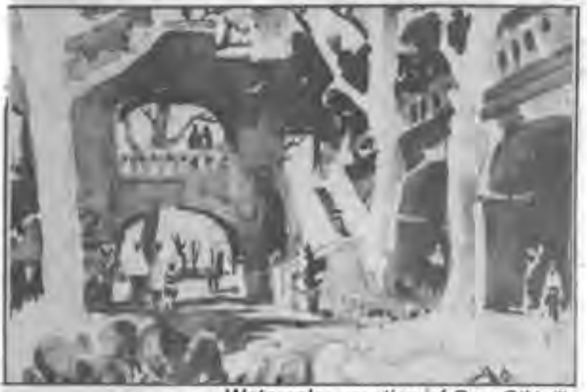
cookal Saturday, September 1, 1984 - 9