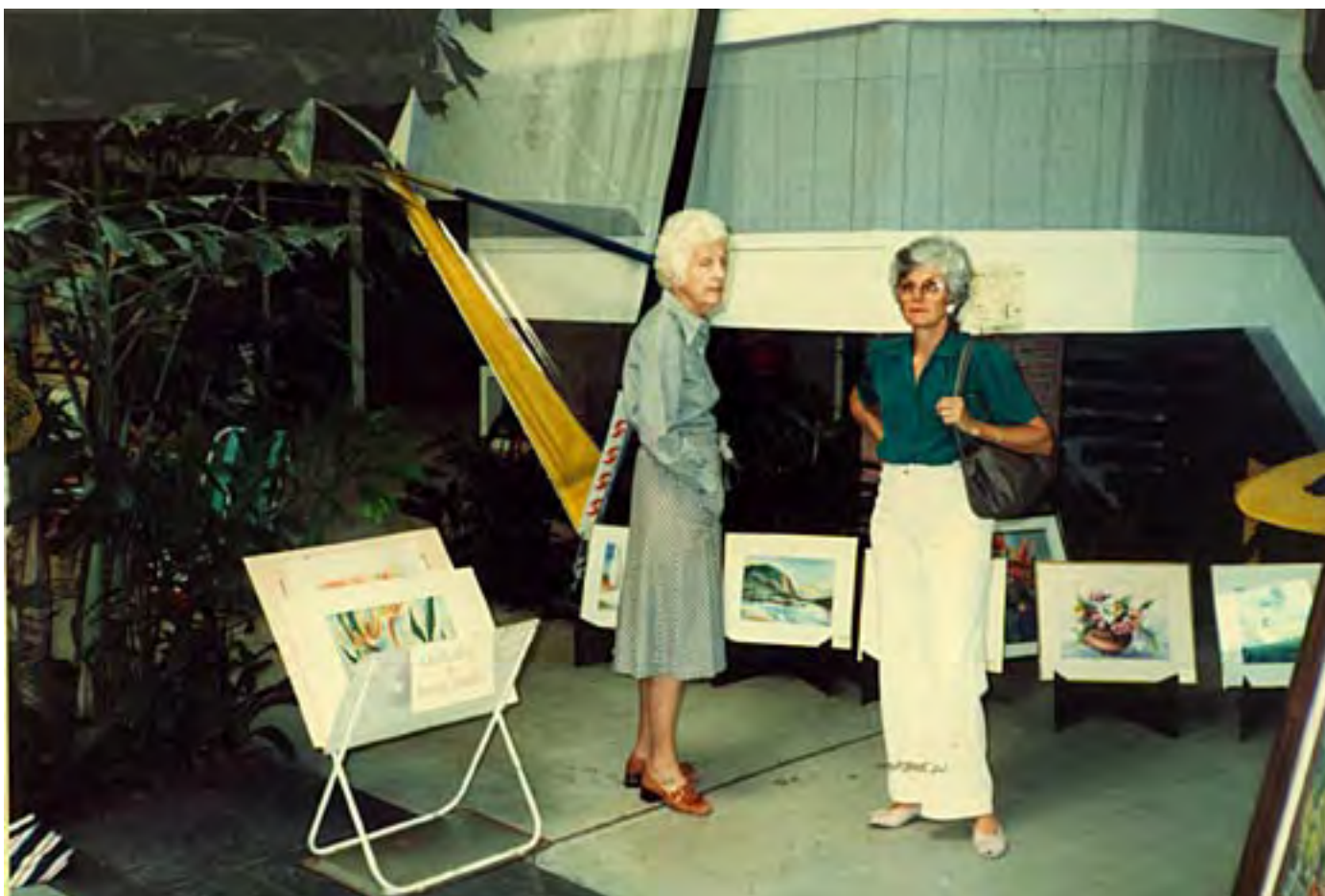
At Cardiff Center