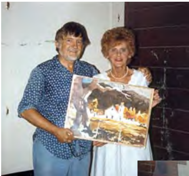
Demo at Quail