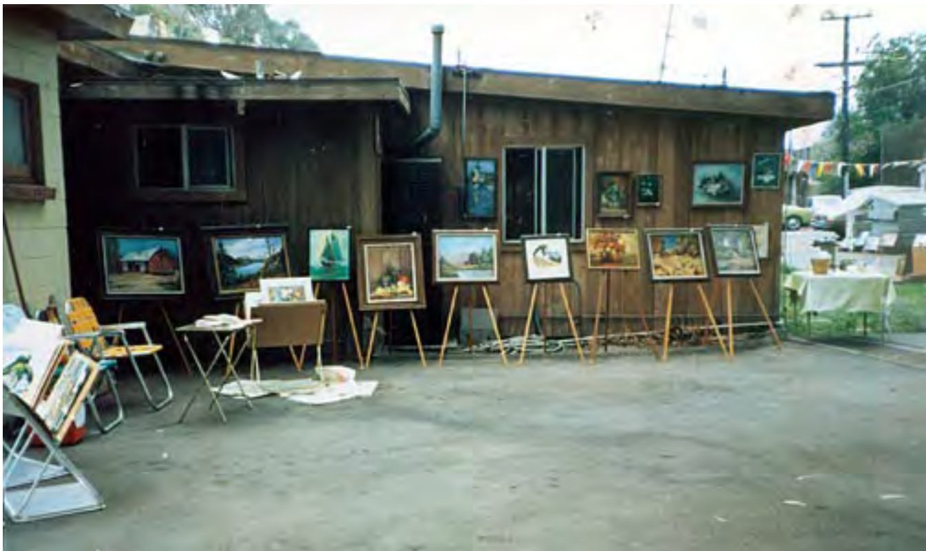
Starving Artists August 1984