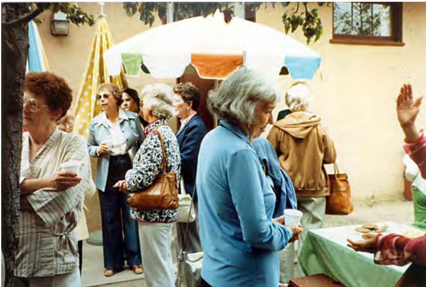
Refreshments in the patio