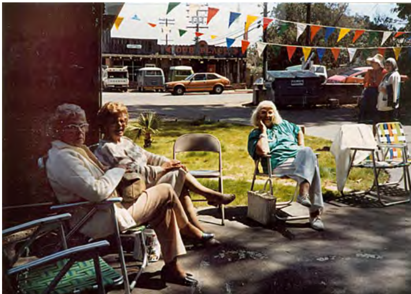
“the rest of us”