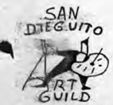
1038-8 N. Huy 101 Legendia, Ca 92024