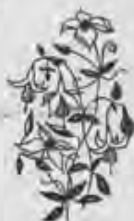
"Signed, Sealed & Delivered" by Britta Kling, Offtrack Gallery

The MULTICULTURAL ARTS INSTITUTE is now accepting entries for the Second Annual Photography Juried Exhibition held October 27-29.