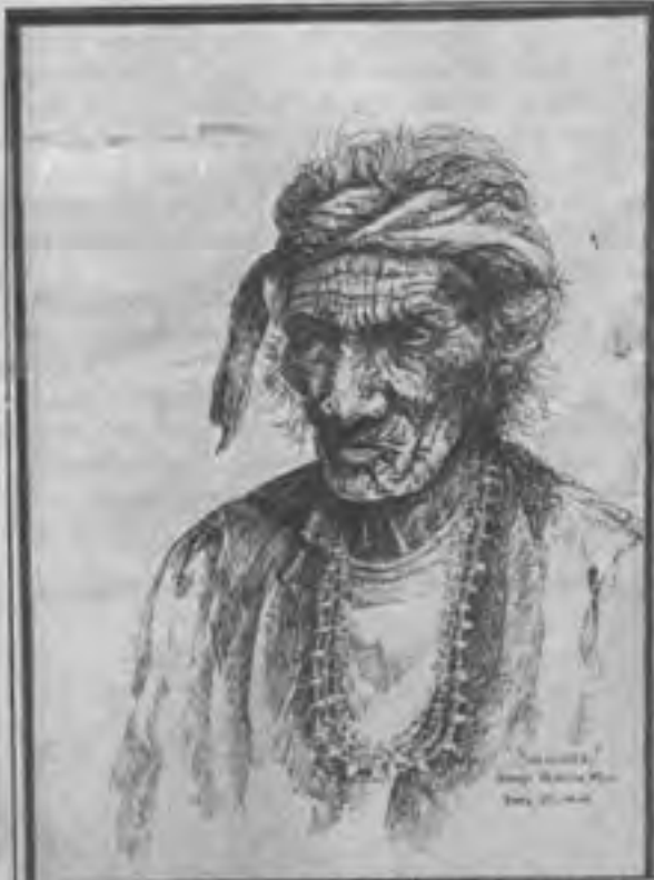
Pen and ink of Navajo medicine man by Sturdevan